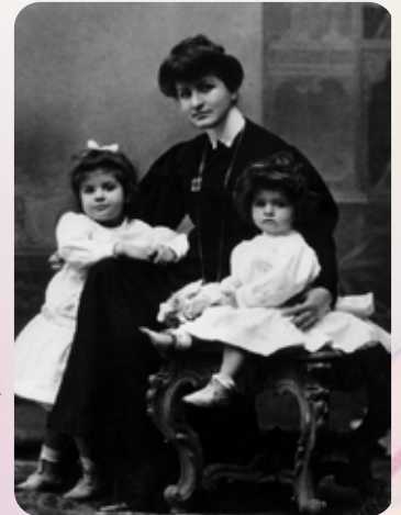
Mahler's wife, Alma, and their two daughters.

Before writing the symphony, he had witnessed the death of one of his daughters and he found out his life would be cut short due to his heart condition. Because of this, there is a tone of death throughout the piece. Even on the last page, there is a bar marked pianississimo (very very quiet) followed by a long pause marked "ersterbend" which means dying. This symphony is often seen as his farewell and his most personal score. He died of heart disease just after writing this symphony at the age of 50. He died before he could hear his Ninth Symphony performed.